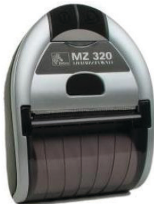
Optional Wireless Printer